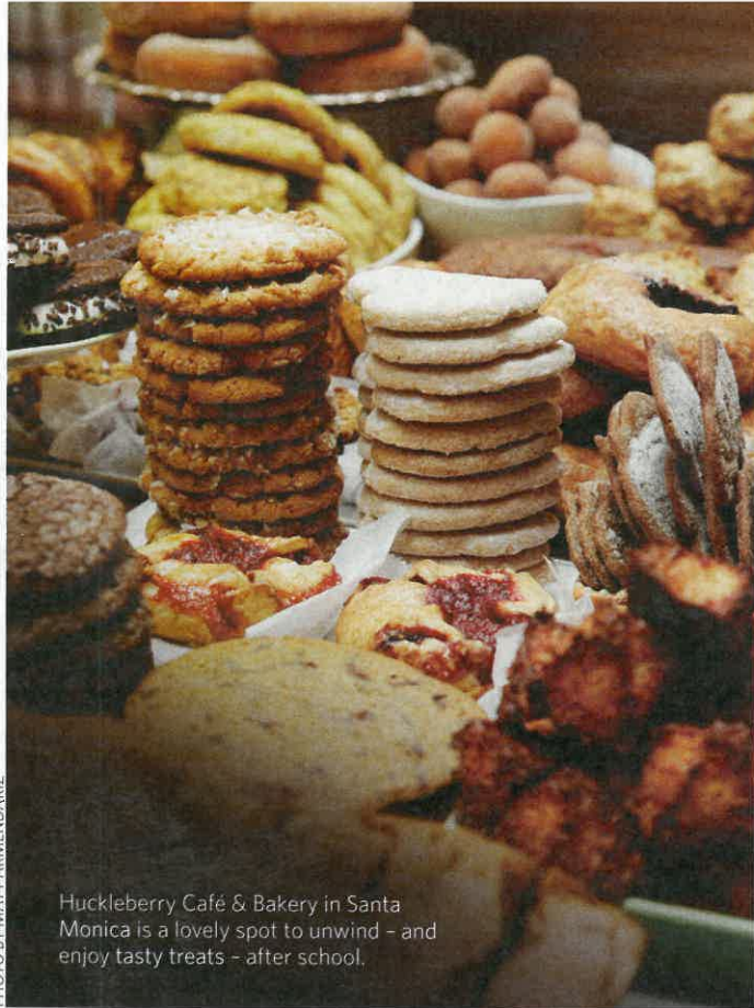
Huckleberry Café & Bakery in Santa Monica is a lovely spot to unwind - and enjoy tasty treats - after school.